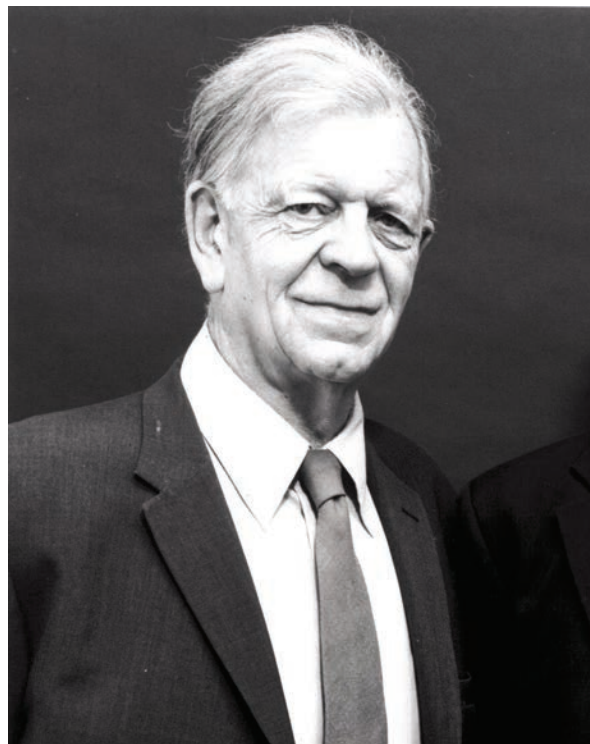
FIGURE 1.6 Sir Alec Skempton (1914–2001), Imperial College, London

Two other important milestones between 1948 and 1960 are (1) the publication of A. W. Skempton's paper on A and B pore pressure parameters, which made effective