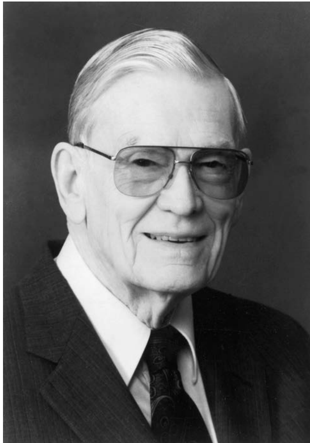
FIGURE 1.9 Ralph B. Peck (1912–2008)