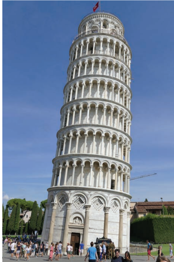
FIGURE 1.2 Leaning Tower of Pisa, Italy

plumb with the 54 m ( \approx 179 ft) height (about a 5.5 degree tilt). The tower was closed in 1990 because it was feared that it would either fall over or collapse. It recently has been stabilized by excavating soil from under the north side of the tower. About 70 metric tons of earth were removed in 41 separate extractions that spanned the width of the tower. As the ground gradually settled to fill the resulting space, the tilt of the tower eased. The tower now leans 5 degrees. The half-degree change is not noticeable, but it makes the structure considerably more stable. The stabilization plan was overseen by a commission of thirteen members hired by the “Opera della Primaziale Pisana.” This commission of thirteen included Professor John B. Burland (UK), Professor Michele Jamiolkowski (Poland), and Professor Salvatore Settis (Italy). John Burland (Figure 1.3) took the lead in this 30 million Euro project to its successful completion.