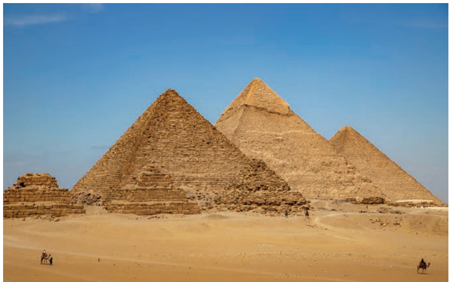
FIGURE 1.1 A view of the pyramids at Giza

One of the most famous examples of problems related to soil-bearing capacity in the construction of structures prior to the 18th century is the Leaning Tower of Pisa in Italy (See Figure 1.2). Construction of the tower began in 1173 A.D. when the Republic of Pisa was flourishing and continued in various stages for over 200 years. The structure weighs about 15,700 metric tons and is supported by a circular base having a diameter of 20 m ( \approx 66 ft). The tower has tilted in the past to the east, north, west, and, finally, to the south. Recent investigations showed that a weak clay layer existed at a depth of about 11 m ( \approx 36 ft) below the ground surface compression of which caused the tower to tilt. It became more than 5 m ( \approx 16.5 ft) out of