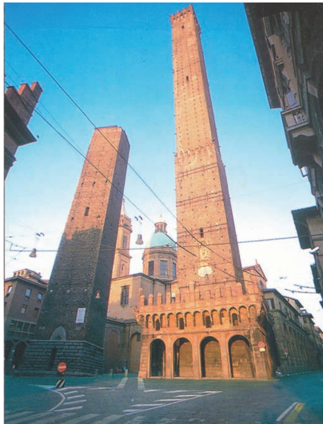
FIGURE 1.4 Tilting of Garisenda Tower (left) and Asinelli Tower (right) in Bologna, Italy