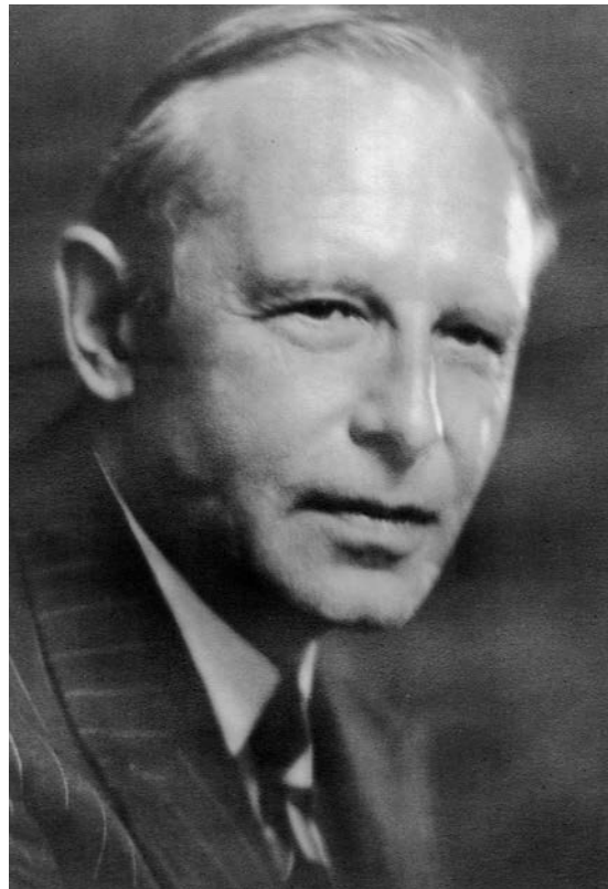
FIGURE 1.5 Karl Terzaghi (1883–1963)

Karl Terzaghi (1883–1963) of Austria (Figure 1.5) developed the theory of consolidation for clays as we know it today. The theory was developed when Terzaghi was teaching at the American Robert College in Istanbul, Turkey. His study spanned a five-year period from 1919 to 1924. Five different clay soils were used. The liquid limit of those soils ranged between 36 and 67, and the plasticity index was in the range of 18 to 38. The consolidation theory was published in Terzaghi's celebrated book Erdbaumechanik in 1925.